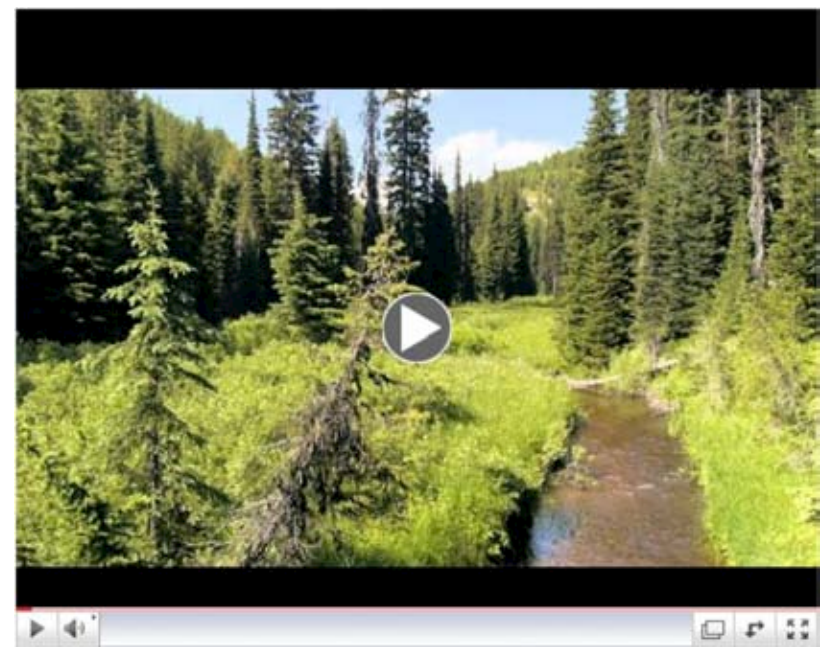
Glade Creek Campsite

Watch videos of Historic Preservation Projects around the state on the Trust's new Video Blog Site: <u>http://idahoheritage.org/blog/</u>.