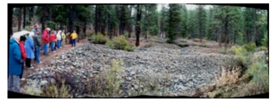
Field Trip attendees check out Hop Lee's Placer Claim during the Idaho's Heritage Conference

The Trust led the organization of the first Idaho's Heritage Conference for historians, museums, preservationists, and archaeologists to network, share ideas, and preserve Idaho's past. The range of topics discussed, the variety and expertise of the speakers, and the opportunity to make new connections made the conference an excellent event. Over 200 people attended from Sandpoint to Dubois. The results of a participant survey indicated 91% rated the conference as "Excellent" or "Very Good" and 98% would like the conference to be an ongoing event located around the state. Plans are being made for the next conference in 2015.